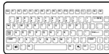
Slim Cool 12" Sealed Keyboard, No Numeric Keypad