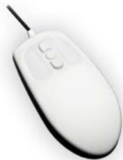
Mighty Mouse/ Mighty Mouse 5