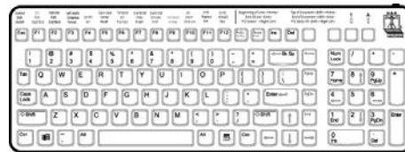
Really Cool M/CS Meditech™ Version