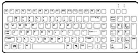
Really Cool 15" Sealed Keyboard