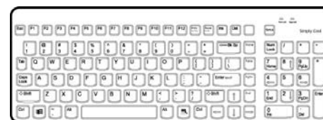
Simply Cool 15" Sealed Keyboard