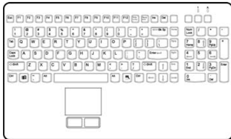
Really Cool + With Integrated Touch Pad